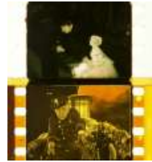
" The Fire Brigade" (1926)

We now have a complete ( 23:01 ) written score (PDF) of the Laurel and Hardy classic , The Second Hundred Years. Amazon offers this silent classic in a DVD-set (used) starting at $249.00 ! Are you sure you want to spend $ 249.00 to see silent Laurel and Hardy ? The Laurel & Hardy sound features after 1931 (50 of them) are offered on Amazon totally for $45.00.