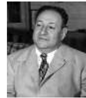
Erich W. Korngold

One of the items to be accomplished at the Nov 18 th meeting is the creation of a 2018 Nominating Committee for the search for 2018 candidates for the January 2018 election. We publish the names of the committee members (HTOS members, of course ). People (again, HTOS members) who want to run and serve as officers may approach the members of the Nominating Committee and let the committee know of your intentions to run. The names of the candidates are presented and then published in the HTOS newsletter. This is then the slate of candidates. Anybody wanting to run for office may throw their hat into the election ring at the last minute . . . if not, the slate is automatically elected. It means we never go past an election day empty-handed without new officers.