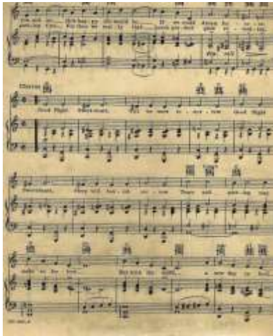
“ Good Night Sweetheart “ chorus beginning